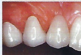
Before and after – the gap was filled using a bridge.